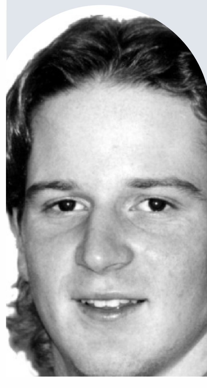
PEOPLE HELPING PEOPLE